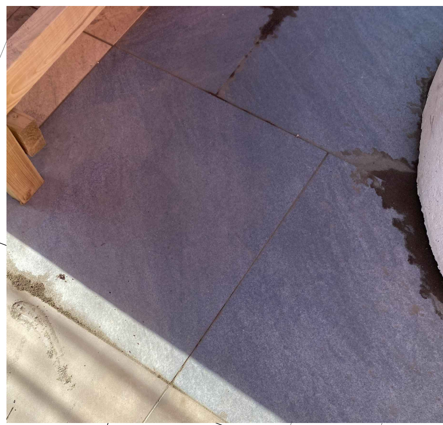
Proposed black limestone paving to match existing

The contractor is to check and verify all building and site dimensions, levels, and sewer invert levels at connection points before work starts. This drawing must be read with and checked against any structural or other specialist drawings provided. The contractor is to comply in all respects with the current Building Regulations whether or not specifically stated on these drawings. This drawing is not intended to show details of foundations or ground conditions. Each area of ground relied upon to support the structure depicted must be investigated by the contractor and suitable methods of foundations provided. This drawing is to be read in conjunction with all other standard STONE ME! DESIGN LTD specifications and documentation This drawing remains the copyright of STONE ME! DESIGN LTD and cannot be reproduced without prior permission. STONE ME! DESIGN LTD reserves the right to withdraw any drawings from any applications or third parties should disputes arise between the client and STONE ME! DESIGN LTD